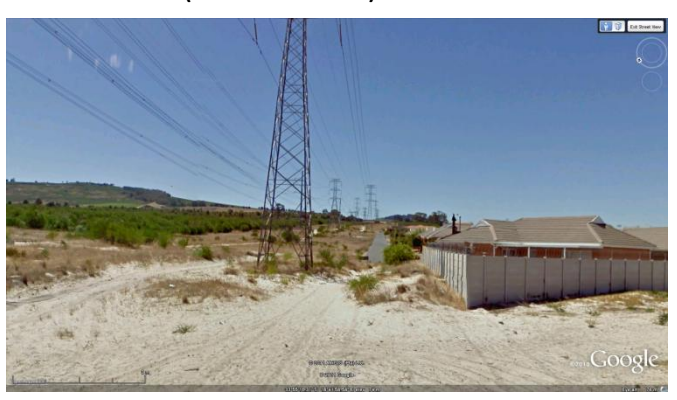
Figure 6 Looking in a southerly direction towards Kuils River (wine lands left distance) the existing corridor which will re-utilised.