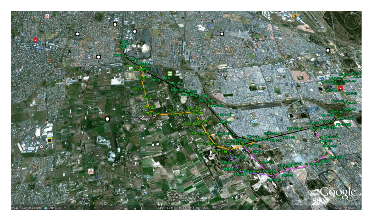
Figure 8. The Phillippi Horticultural Area. Options PM2 (yellow) and PM4 (pink) will result in a medium – high visual impact as they are likely to be conspicuous from within the Phillippi Horticultural Area. Option PM 1 (black) will result in a low impact to the cultural landscape as this is the furthest from the horticultural area and lies within an existing infrastructure corridor of low visual appeal (Vanguard Drive) hence this alternative is favoured.