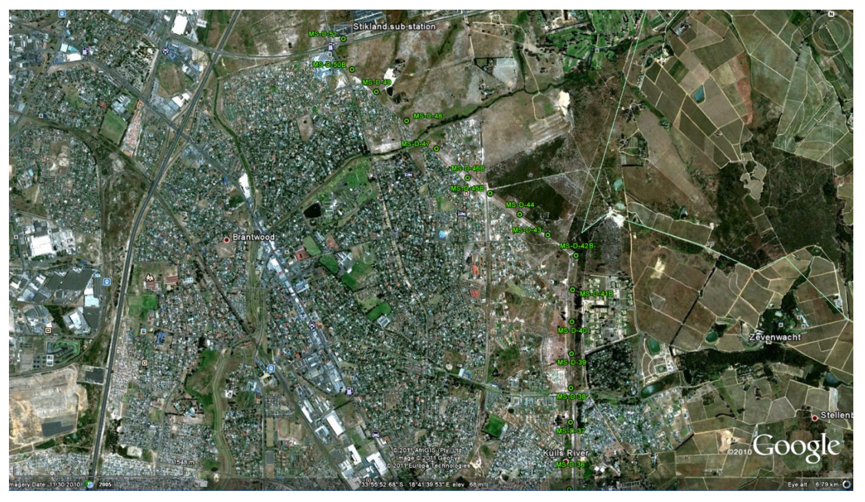
Figure 4 The proposed route of the Mitchells Plain – Stikland transmission line involves the re-use of an existing servitude that already contains a clutter of electrical infrastructure. Sensitive areas such as Zewenwacht and adjoining farm Langwerwacht are buffered by recent development areas to the west of the existing servitude.

Confirmation by Eskom that it is technically possible to re-utilise existing servitudes that run through corridors in existing recent suburbs has alleviated this threat. The wine lands edge will therefore be buffered by recent development areas and the existing milieu of existing transmission lines (which would need to be re-rationalised to accommodate new services). Hence all activities will occur in areas that have been subject to previous electrical related activity. Had the transmission line had to be routed to the urban edge, the likely impacts would have been considerably greater.