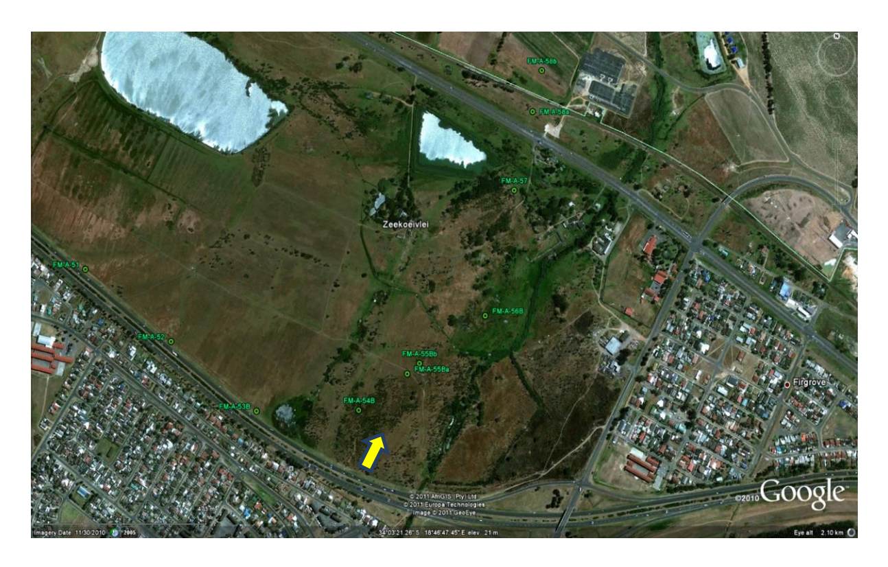
Figure 1 Above: the location of Zeekoevlei Farm House in relation to proposed tower positions. The yellow arrow marks the view point (below) showing the servitude and existing transmission lines that mark the proposed route. The remains of the farm house is obscured by recent vegetation growth.

This early 19<sup>th</sup> century dwelling was destroyed by fire in early 2011 after the holding company (golf course development) was liquidated and the building abandoned. The location of transmission lines a short distance to the east of the dwelling house would have constituted an impact, however a recent site inspection revealed that the house had been so completely destroyed that its status a significant heritage indicator is massively reduced. The land is destined to become a golf course development, while the area directly affected by the proposed transmission lines is no longer farmed and overrun with alien vegetation. The proposed transmission line across the property to Firgrove Substation follows an existing servitude and transmission lines.