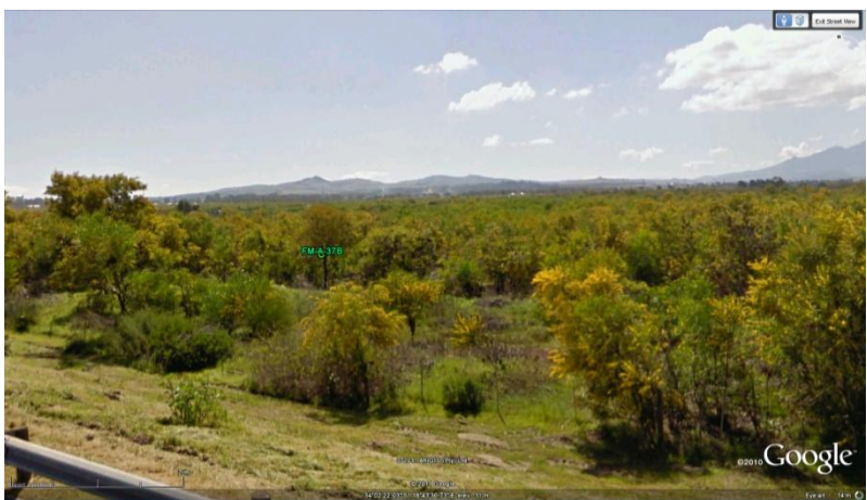
Figure 2 Above: The positions of proposed towers are placed south of the N2 apart from where the transmission lines have to cross the N2 to avoid the Kyalitsha wetlands. Vergenoegd is located at the pond at the centre of the image. Left: View towards Vergenoegd from an elevated position on the N2 (yellow arrow above). The historic werf just over 1000 m away is hidden from view by dense alien vegetation.