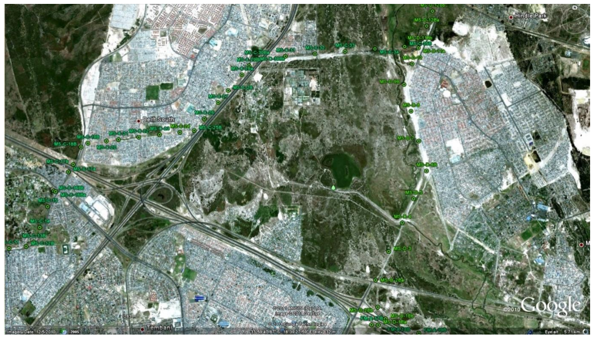
Figure 3 The Driftsands Nature Reserve. Transmission line routes utilise existing corridors and avoid core areas of the reserve.

Driftsands is surrounded by suburbia, roads, electrical services, low cost housing and informal settlements. While the transmission lines for all routes will be visible from inside the reserve, none of them impact the core areas. In the context of the surrounding urban clutter, transmission lines do not constitute an unexpected presence. Given that the opportunities for routing transmissions lines in urban areas are extremely limited, all alternatives presented represent a reasonable compromise. Route options C and D are equally acceptable constituting a medium-low negative impact to the visual qualities of the place. No mitigation is applicable.