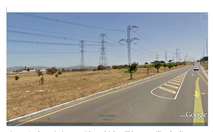
Figure 6 The existing corridor which will be re-utilised adjacent to the Zeewenwacht link road.